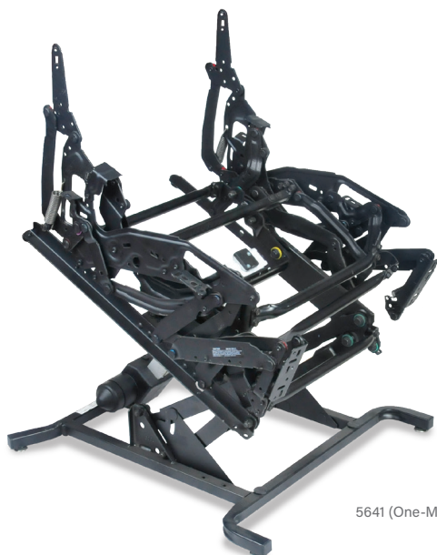
5641 (One-Motor Lift)