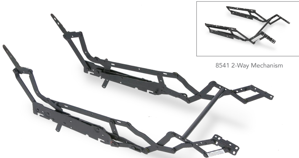
8541 2-Way Mechanism