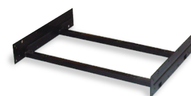
Arm-mounting chassis – available in all sizes listed above.