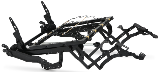
3506 One-Motor Mechanism

CloudZero® Cinema Mechanism (One- or Two-Motor)