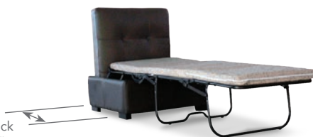
Inside front-to-back dimension – 27.5"